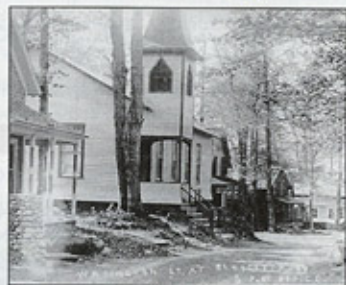
Cottages along Washington Street

The Casino provided a good hall for entertainment until the 1960s when it was torn down.