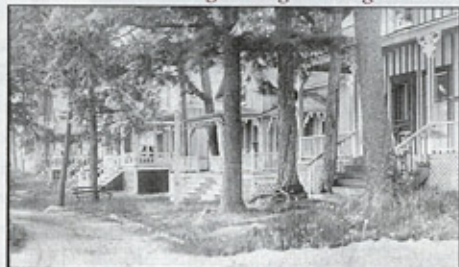
Victorian Cottages along Front Street.