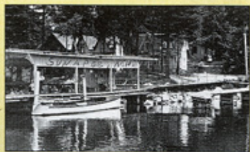
Steamboat Landing at Blodgett's.

"Kamp Komfort Inn" - Date unknown. This hotel was more commonly known as "Forest House" or "Blodgett's Lodge" - torn down in the late 1960s.